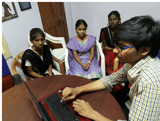
Life skills training programme